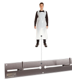
Art. 88936 Edelstahl stainless steel

Nur mit passendem Zubehör Only with suitable accessories