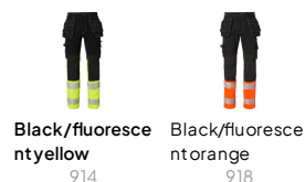
Black/fluorescent yellow 914